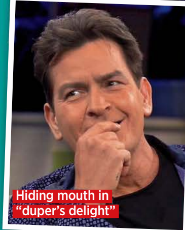
Hiding mouth in "duper's delight"