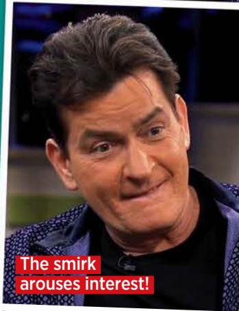
The smirk arouses interest!