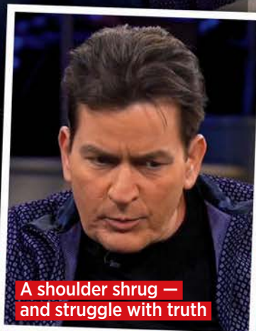
A shoulder shrug — and struggle with truth