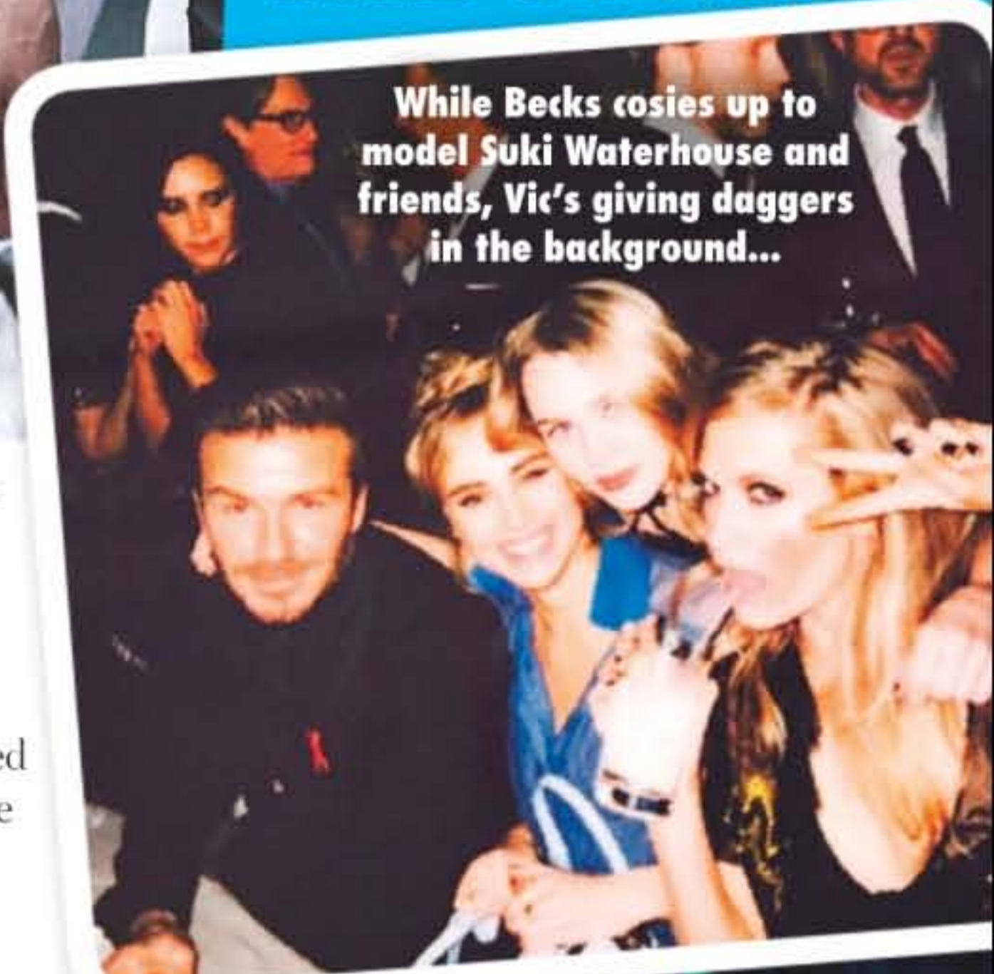
While Becks cosies up to model Suki Waterhouse and friends, Vic's giving daggers in the background...

'David's car accident with Brooklyn has sent her into a nightmare of worry over his driving – something that's worried her for years,' the source says. 'When she's so tired all the time, small things get blown out of proportion.'