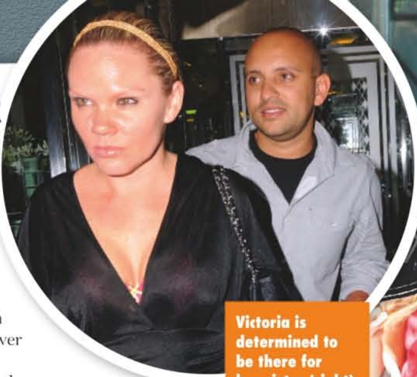
Victoria is determined to be there for her sister (right) during Louise's split from hubby Darren (above).

'Victoria believes David's completely faithful to her, but when these things happen it always upsets her,' the friend explains. 'It was completely innocent, but that hasn't